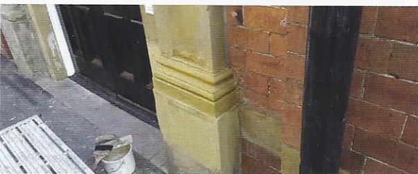
See point 3